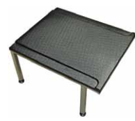
Machine Stand - 50 size Adjustable Feet