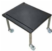
Machine Stand Mobile - 45 Size