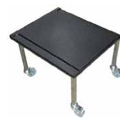
Machine Stand Mobile - 50 Size