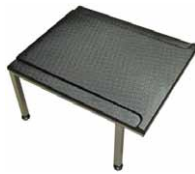
Machine Stand - 45 size Adjustable Feet